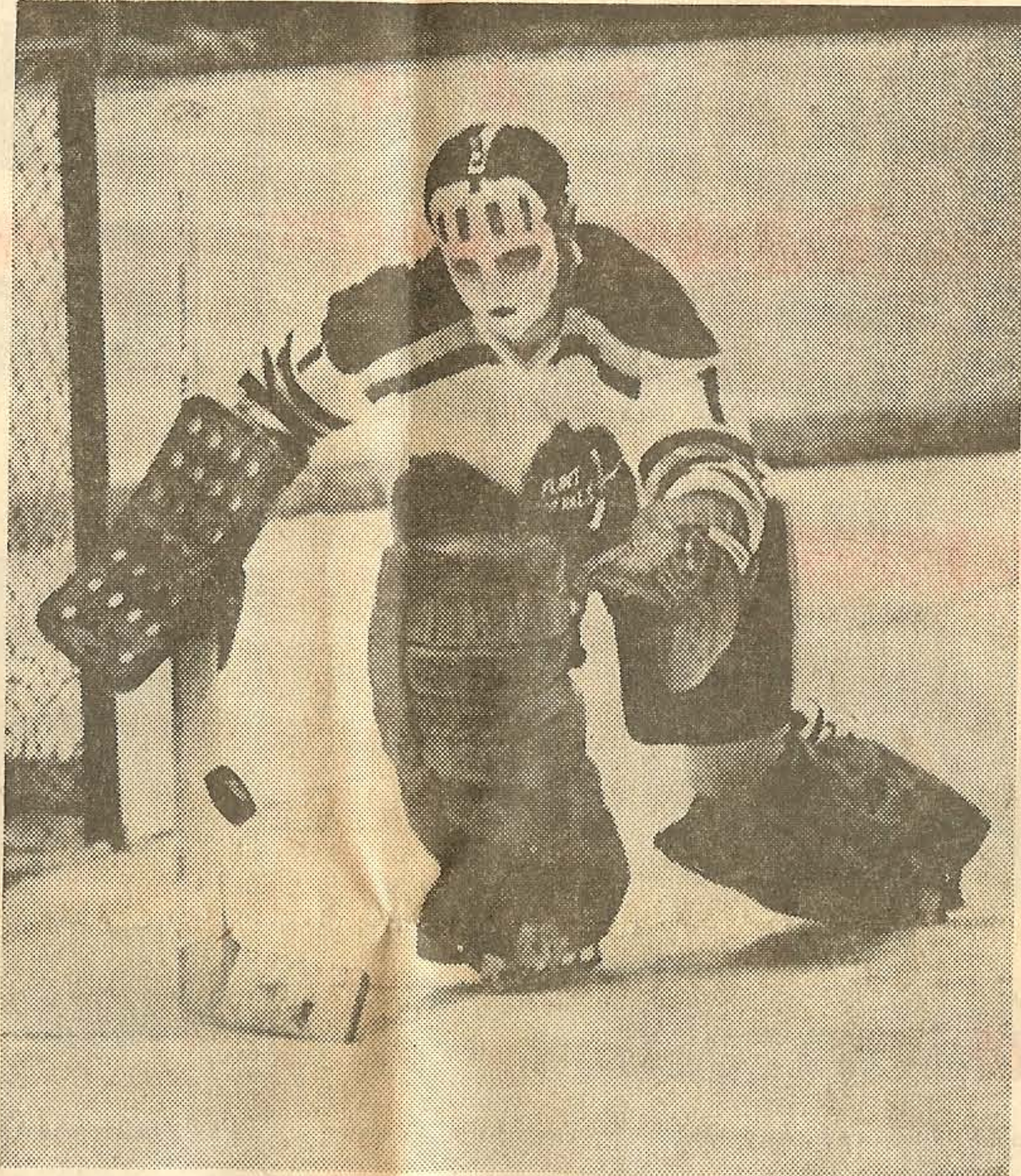
Always Watch the Puck