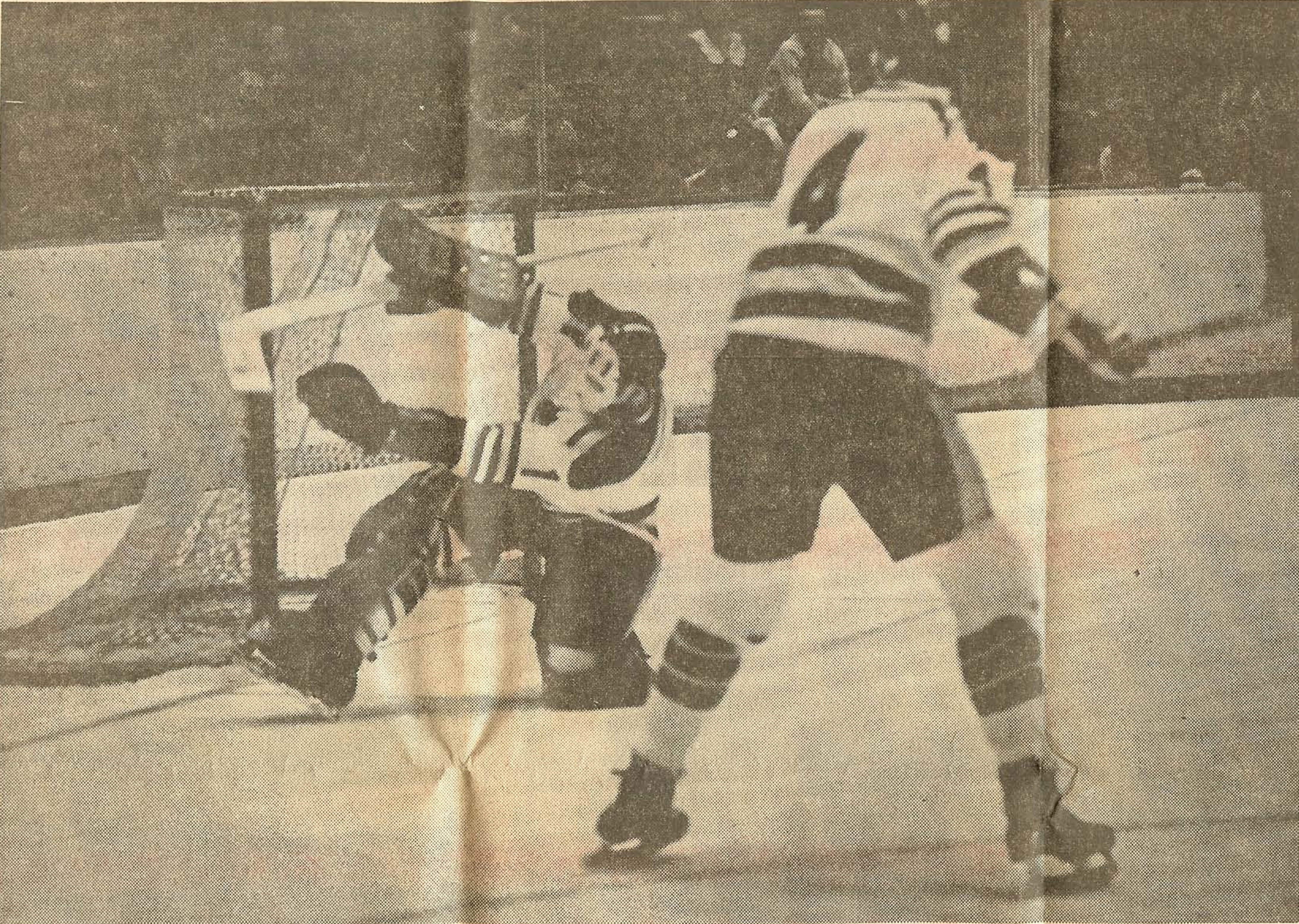
Acrobatics Help to Grab a Whistling Puck With the Glove